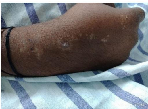
Figure 2: 'lighten up' hyperpigmentation on wrist