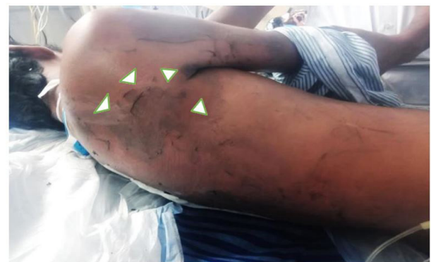
Figure 4: Desquamation of skin in acromial, dorsal region, lumbar region