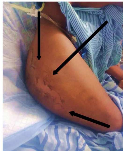
Figure 5: Severe Skin Desquamation on gluteal region