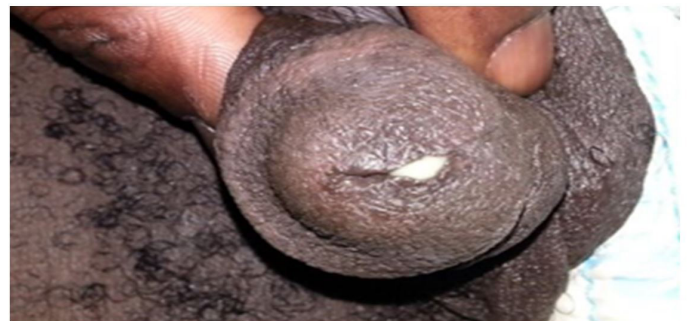
Figure 1: Purulent urethral discharge in an MSM