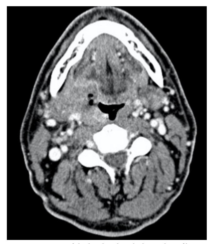
Figure 4. CT scan of the head and neck shows the infiltration of the oropharyngeal carcinoma in the parapharyngeal space, deep tongue muscles and mandible.