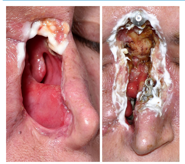
Figure 2. Left. Patient's midface after right partial nasal ablation with resection of the right nasal bony and cartilaginous pyramid, lobule and anterior septum and after 4 further resections.

Right. After right residual nasal ablation with resection of the left bony and cartilaginous nasal pyramid, as well as resection of both frontal beaks and ethmoid cells. Visible metal prosthesis for preliminary care with nasal epithesis.