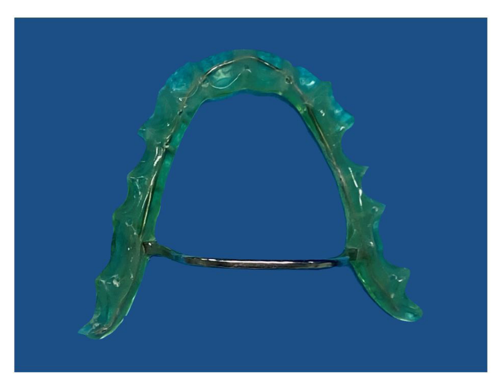
Figure 3: The splint is made of acrylic resine. A steel wire is inserted inside and a stainless steel palatal bar is attached to the splint in the molar region to enhance its rigidity