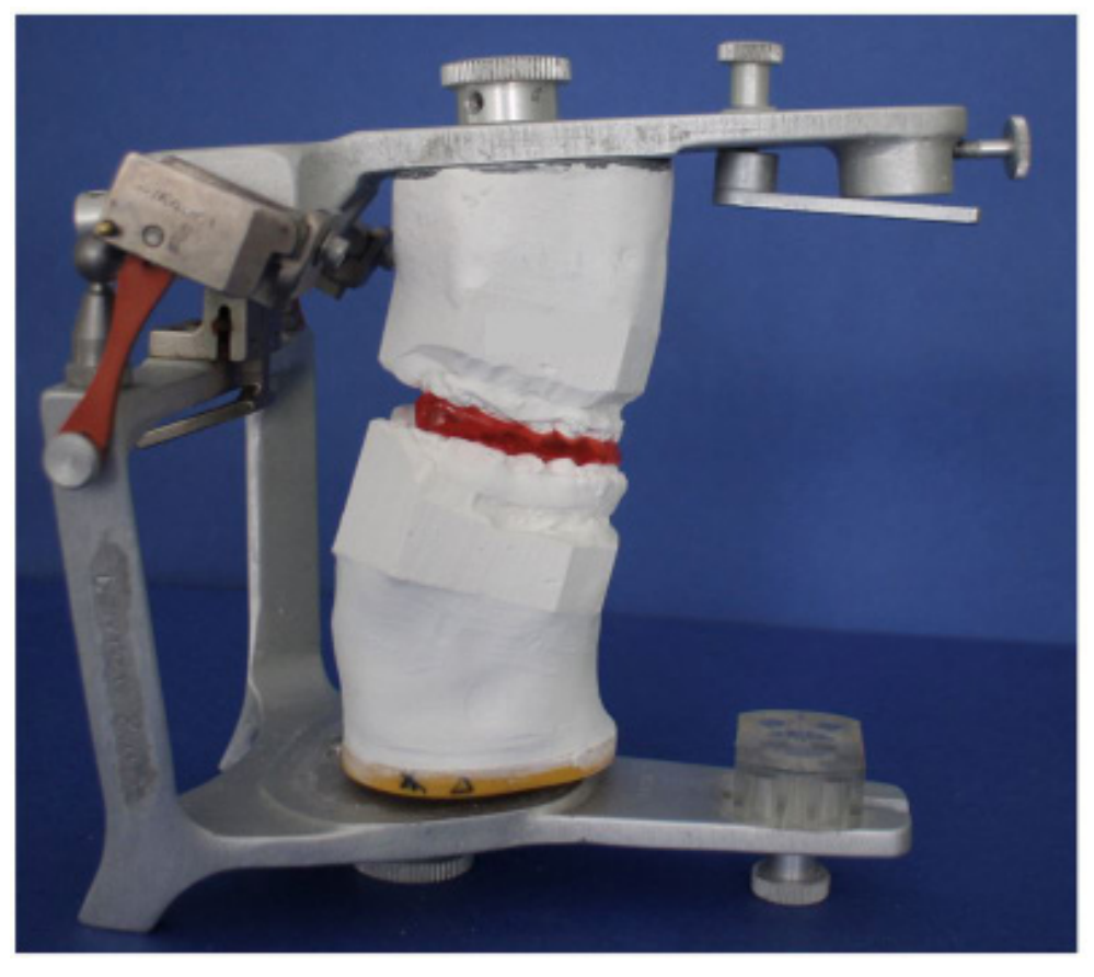
Figure 2: A mandible first sequence is simulated on the articulator: an interim splint is fabricated between the unoperated maxillary cast and the repositioned mandibular cast