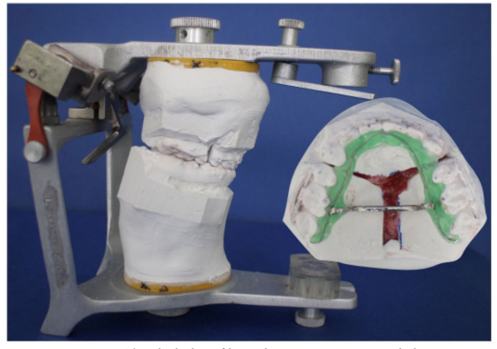
Figure 1: The palatal splint is fabricated on a preoperative cast on which transverse and vertical discrepancies have been previously corrected

It is approximately 3 mm thick and is reinforced internally by a wire to prevent the risk of breakage during intraoral insetting or chewing (Figure 3).