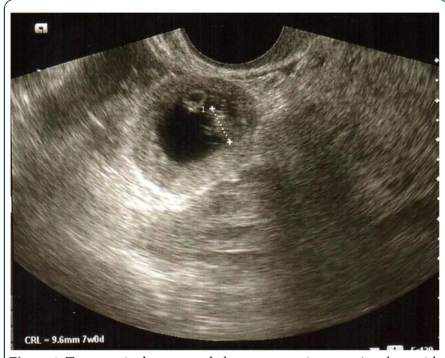
Figure 1: Trans-vaginal scan revealed an extra-uterine gestational sac with fetal echo and fetal heart activity seen.

Upon arrival, she was not pale. Her blood pressure was 126/72 mmHg and pulse rate was 88 beats /minute. Abdominal examination revealed tenderness over supra-pubic region with rebound tenderness but no guarding. Upon bimanual examination, the uterus was anteverted, normal size and mobile. There was positive cervical excitation and both adnexae were tender. Bogginess was felt at the Pouch of Douglas (POD).